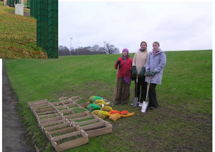
Conservation volunteers planting ← the wild flower bank

We hope to further enhance biodiversity by creating a wetland area in the south east of the site consisting of a pond complex and associated vegetation. Our future tasks also include completing the wildlife corridor so it extends the entire width of the site and replanting and area to the south of the site which currently is dominated by stinging nettles.