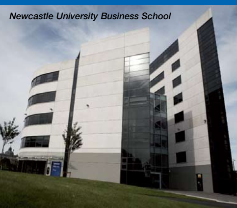
Newcastle University Business School