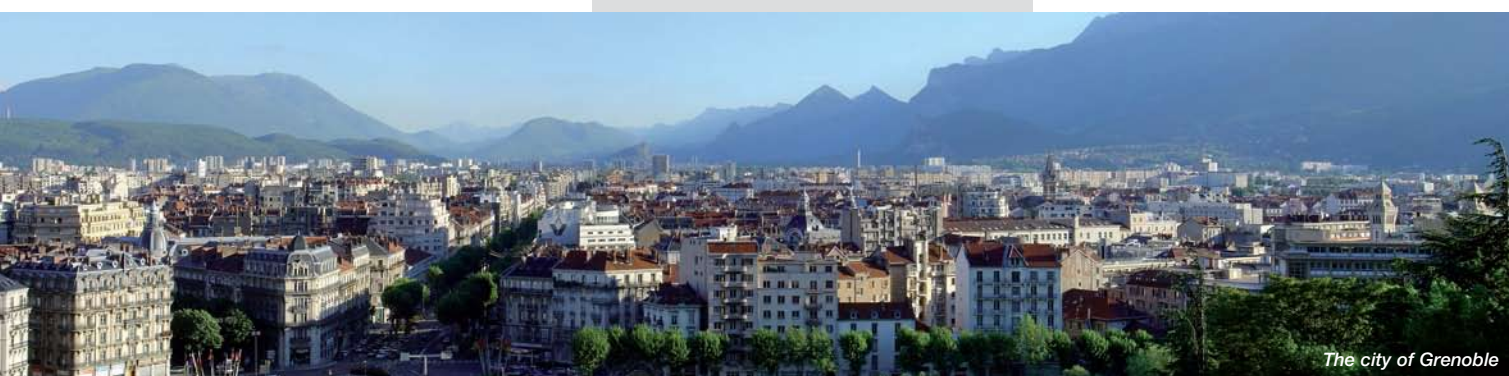
The city of Grenoble

The programme starts in October each year. To apply, please contact the Programme Administrator at either Grenoble or Newcastle. Alternatively, you can contact the Programme Director at either institutions for any specific questions you may have about the DBA or your eligibility for the programme. We encourage applications to be submitted by the end of June, however a late application may be considered if there are still spaces available on the programme.