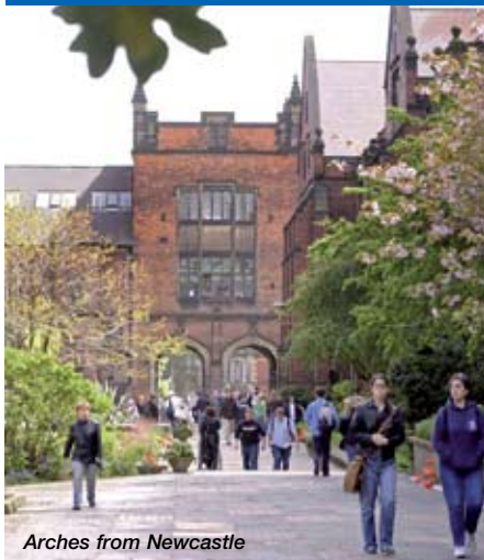
Arches from Newcastle