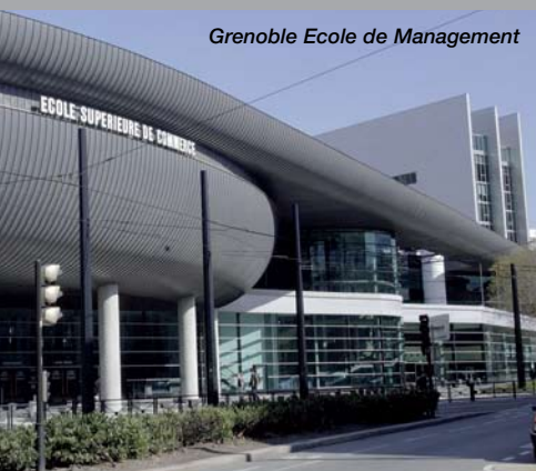
Grenoble Ecole de Management