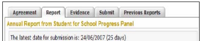
Figure 3. 'Tabs' in the Progression system

After you have logged on and selected 'Progression' (as described above) you will see a set of 'tabs':