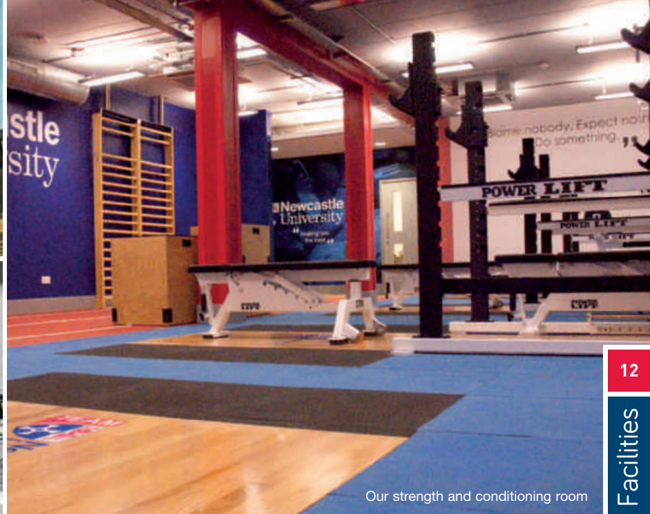
Our strength and conditioning room