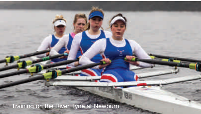
Training on the River Tyne at Newburn