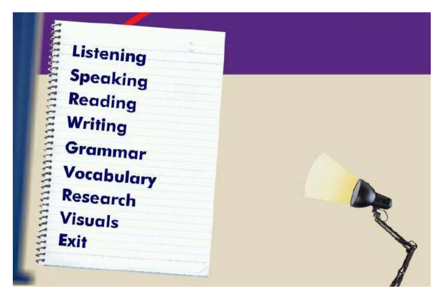
Navigating the program topics is very intuitive and fairly straightforward – you may not even need to use the program help!

The main program menu will now be displayed on screen. It should look something like the picture below. Each menu option contains different section topics. First select the main program feature. A tick appears next to it to indicate it has been selected, and a further menu appears listing selectable sub-topics. Use the mouse to point and click.