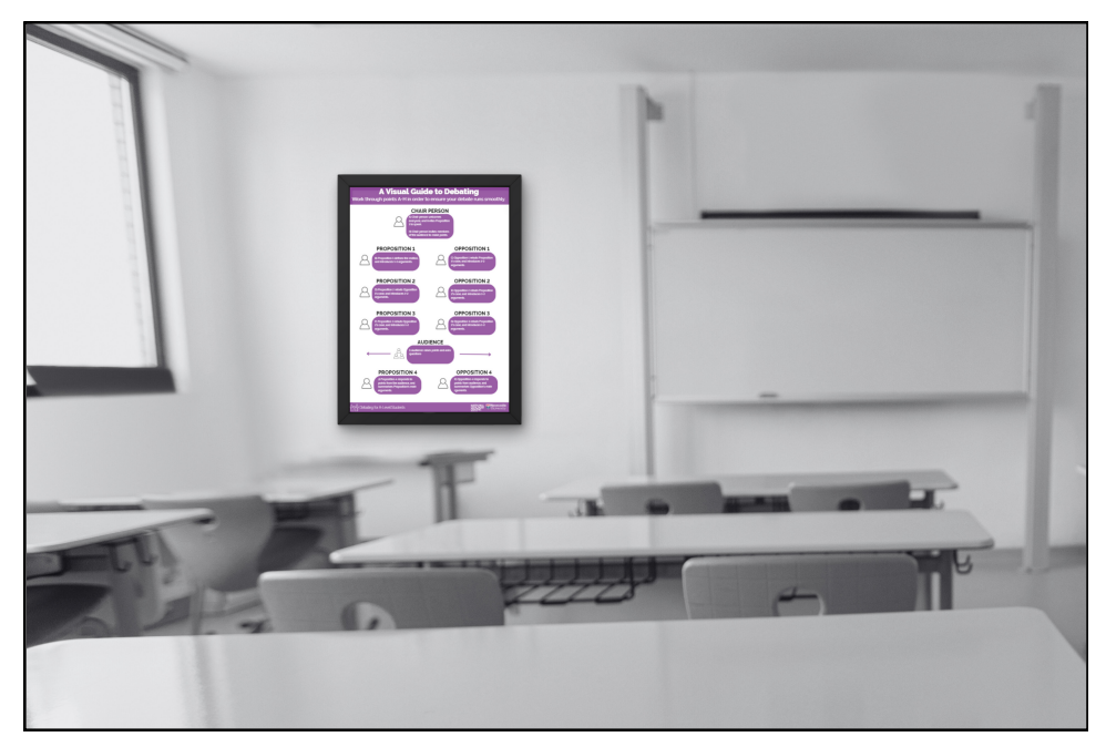
A visual guide to debating displayed in a classroom