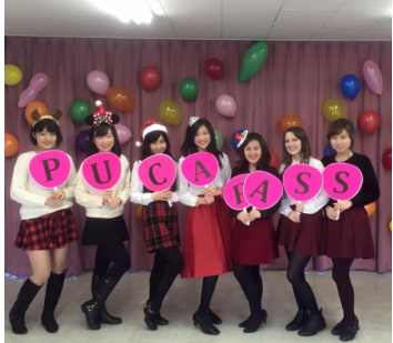
my dance club

there were lots of other exchange students from all around the world, which let me learn a lot about other countries and also confuse them about ours (what ex-