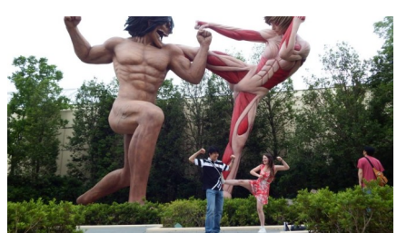
With my Newcastle tandem partner

the size of Newcastle. Luckily, ICU is in the middle of a forest conveniently located 30 minutes from Shinjuku! I lived in a dorm where 95% of students were Japanese, even my roommate, so from the first day I was immersed in the language. Luckily, they were all so welcoming and put up with